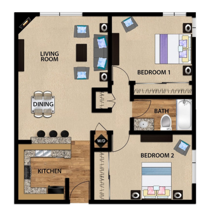
2BEDROOM / 1BATHROOM - B1 Approx. Sqft: 800