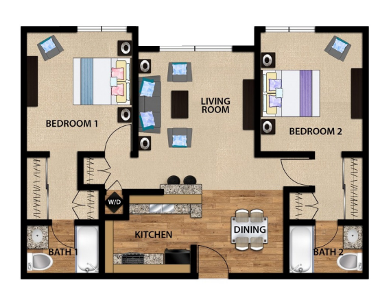
2BEDROOM / 2BATHROOM - A1 Approx. Sqft: 900