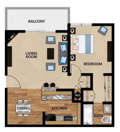
1BEDROOM / 1BATHROOM - E2 Approx. Sqft: 714