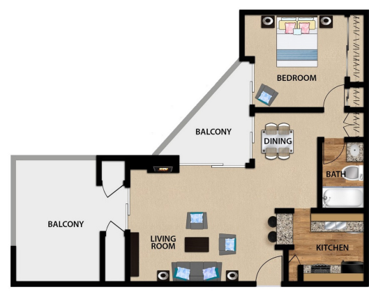
1BEDROOM / 1BATHROOM - F Approx. Sqft: 714