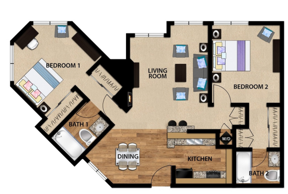
2BEDROOM / 2BATHROOM - D1 Approx. Sqft: 1,025