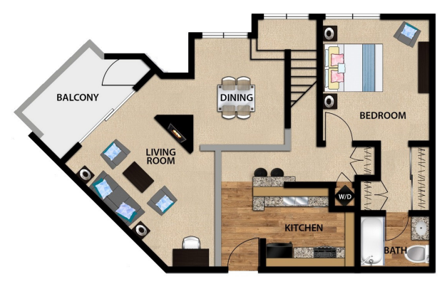
1BEDROOM / 1BATHROOM LOFT - H Approx. Sqft: 850