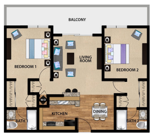
2BEDROOM / 2BATHROOM LOFT - A3 Approx. Sqft: 900