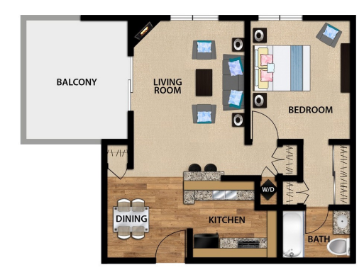
1BEDROOM / 1BATHROOM - G Approx. Sqft: 714