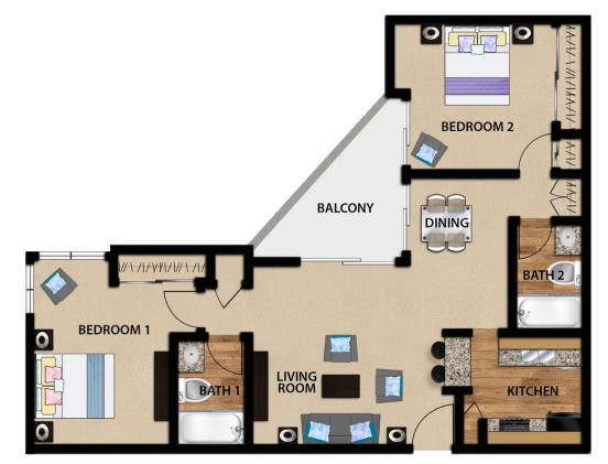
2BEDROOM / 2BATHROOM - C Approx. Sqft: 1,025