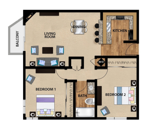
2BEDROOM / 1BATHROOM - B2 Approx. Sqft: 800