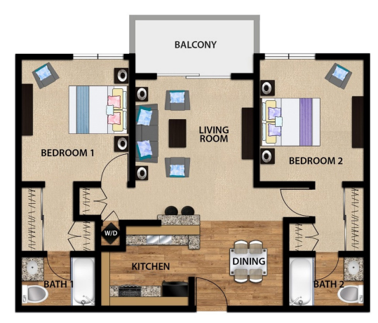
2BEDROOM / 2BATHROOM - A2 Approx. Sqft: 900

562.634.2682 | Paramount.Terrace@FusionPMC.com | ParamountTerrace.com