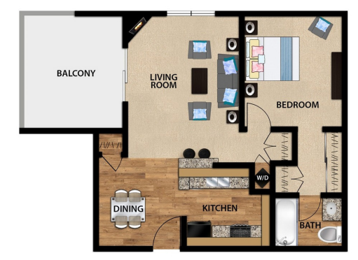
1BEDROOM / 1BATHROOM - E3 Approx. Sqft: 714