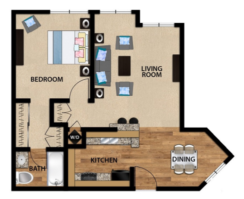
1BEDROOM / 1BATHROOM - I Approx. Sqft: 714

562.634.2682 | Paramount.Terrace@FusionPMC.com | ParamountTerrace.com