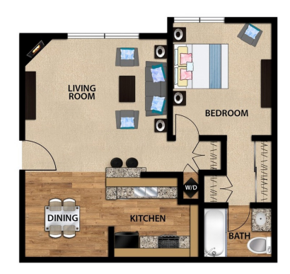
1BEDROOM / 1BATHROOM - E1 Approx. Sqft: 714

562.634.2682 | Paramount.Terrace@FusionPMC.com | ParamountTerrace.com