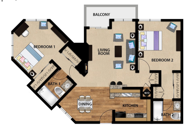
2BEDROOM / 2BATHROOM - D2 Approx. Sqft: 1,025